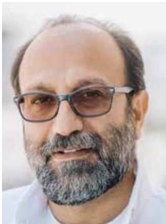
ASGHAR FARHADI DIRECTOR / IRAN

Multi-award-winning director and screenwriter Asghar Farhadi was born in Iran in 1972. He started his education in filmmaking as a teenager when he joined the Youth Cinema Society of Esfahan. After obtaining a bachelor's degree in theatre and a master's degree in stage direction, Farhadi made his feature directorial debut with Dance in the Dust (2003). His third feature, Fireworks Wednesday (2006), won the Gold Hugo at the Chicago International Film Festival, while About Elly (2009) won the Silver Bear for Best Director at the Berlin International Film Festival. His next film, A Separation (2011), was a sensation, winning critical acclaim and a plethora of awards worldwide, including the Academy Award for Best Foreign Language Film, making Farhadi the first Iranian filmmaker to win an Oscar. He went on to make further notable films, including The Past (2013), The Salesman (2016), which gave him his second Oscar for Best Foreign Language Film, Everybody Knows (2018) and A Hero (2021).