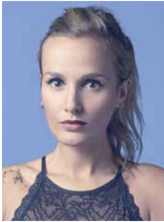
JULIA DUCOURNAU DIRECTOR / FRANCE

French film director and screenwriter Julia Ducournau was born in 1983. She attended La Fémis, where she majored in screenwriting, and gained international attention in 2011 when her short film Junior was selected for the Semaine de la Critique at the Festival de Cannes. Her first feature-length film, Raw (2016), generated a shockwave when it was presented in the Semaine de la Critique, when it was awarded the FIPRESCI Prize. Her second feature, Titane (2021), presented in the Official Competition at Cannes, won the Palme d'Or.