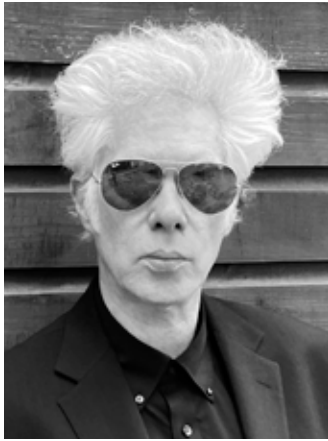
JIM JARMUSCH DIRECTOR / USA